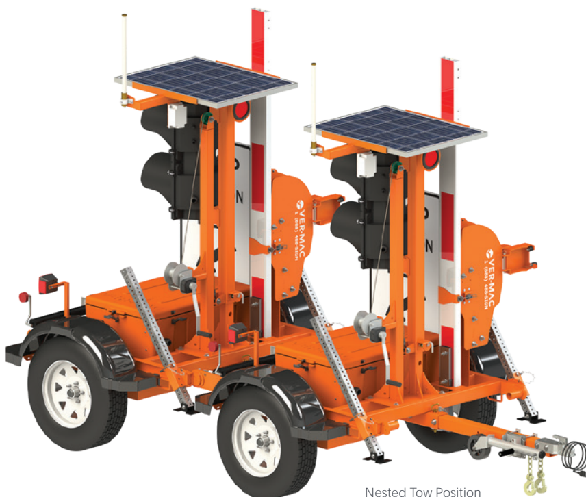
Nested Tow Position